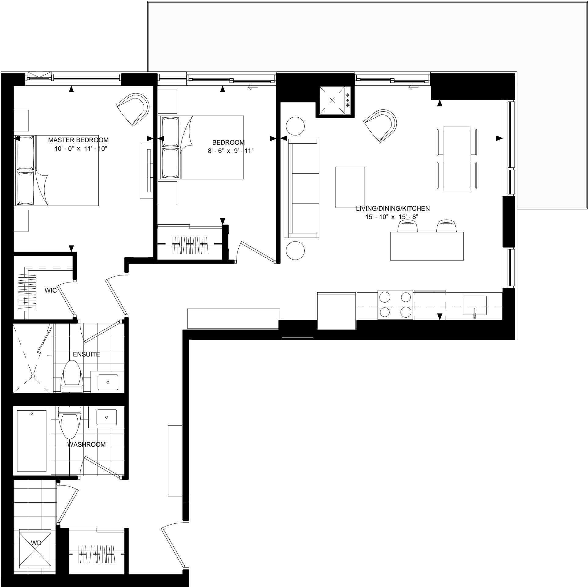
SUITE 2-I SUITE AREA: 898 sf