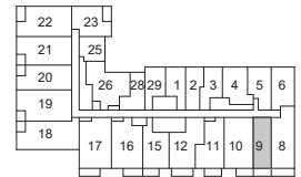
FLOOR 7 UNIT 709 SLAB TO SLAB HEIGHT 9'0"